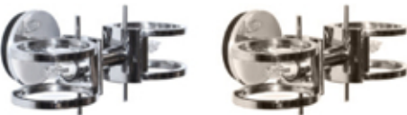
chrome cod 605