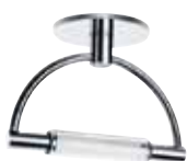
shiny chrome opalescente cod 529