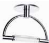
satin chrome opalescente cod 1529