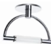
satin chrome tuttopalescente cod 1583