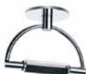
shiny chrome retinato cod 518