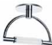
shiny chrome tuttopalescente cod 583