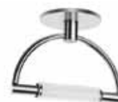
satin nickel-plated tuttopalescente cod 585