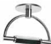
satin nickel-plated retinato cod 520