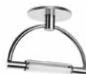
satin nickel-plated opalescente cod 589