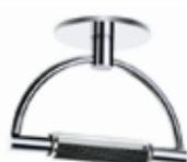
satin chrome retinato cod 1518